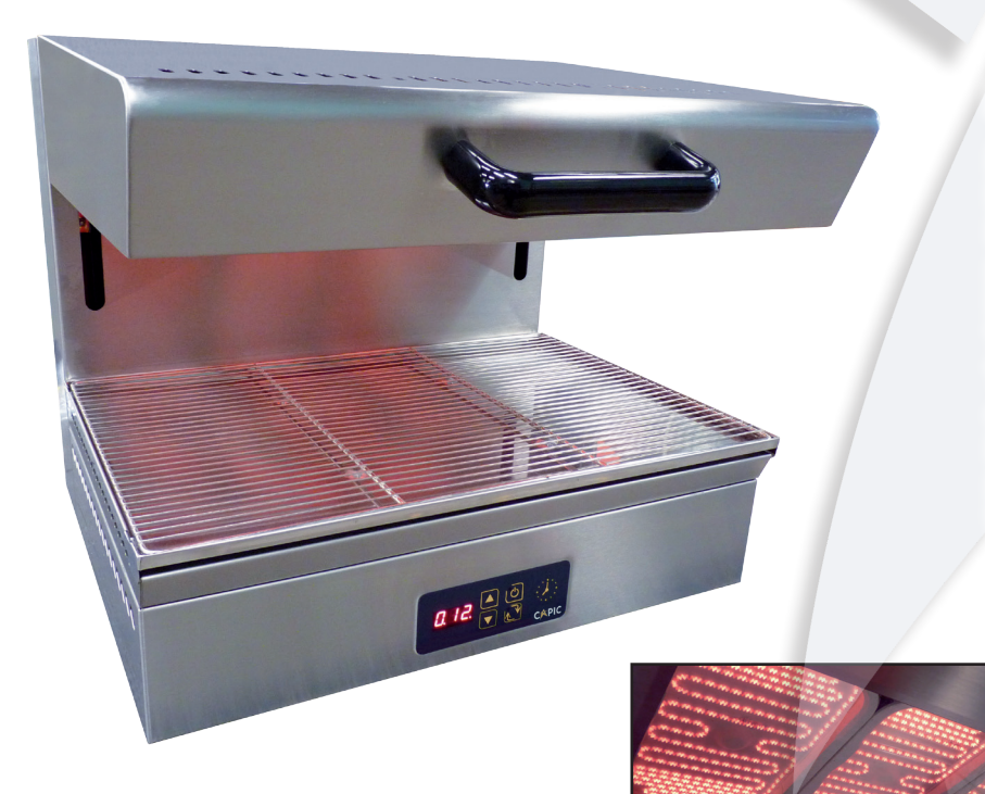
Glass panel can be easily cleaned.